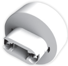
LR34139* OPTIONAL FA8/R17D PIN CONVERSION SET *SOLD SEPARATELY